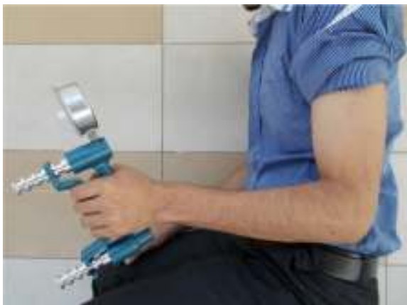
Fig 1. Left hand Measurement

Statistical data analysis were performed by statistician who was blinded to the study by using Microsoft excel and SPSS software. Mean of three trail of power grip of dominant and non-dominant hands were calculated for each individual. Percentage of each individual are calculated using the formula (1-NDH/DH) 100 for all the 30 subjects. The resultant data was used in the SPSS software for further descriptive and inferential statistics.