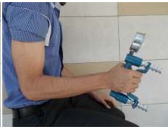
Fig 2. Right hand measurement